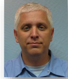
Charles Woody Utilities