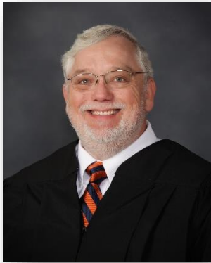
Honorable Judge Greg Waldrep Municipal Court Judge