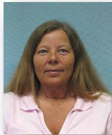
Ruby White Municipal Court