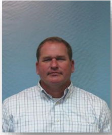
Gil Griffith Building Department