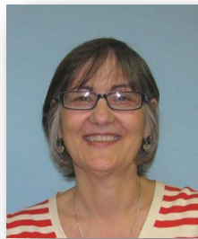
Michele Kilday Library